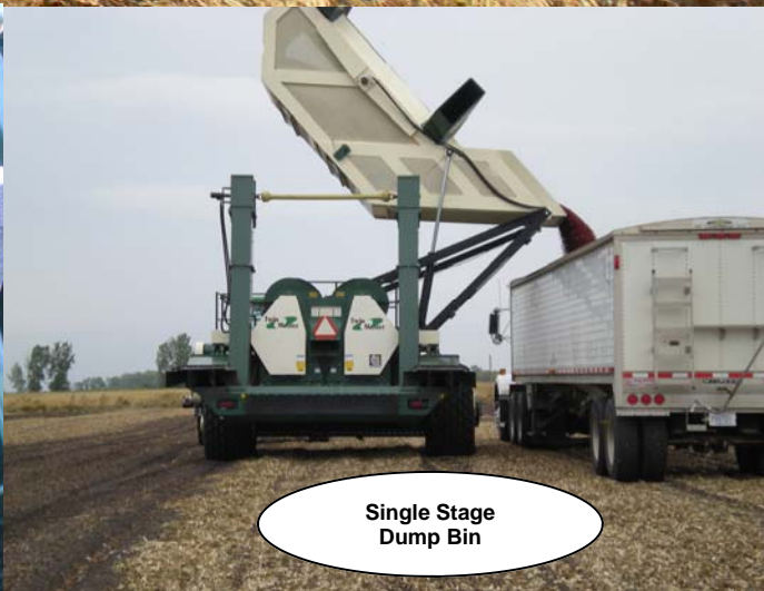
Single Stage Dump Bin