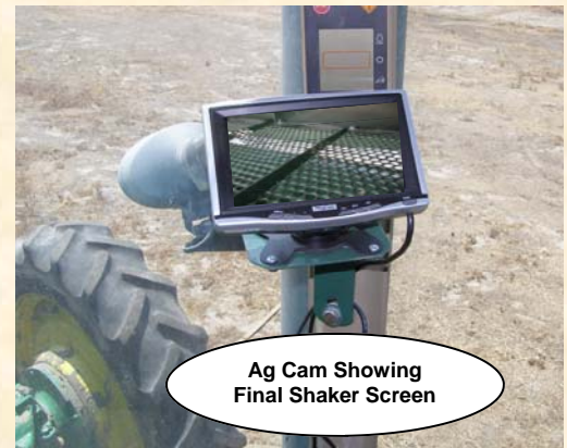
Ag Cam Showing Final Shaker Screen