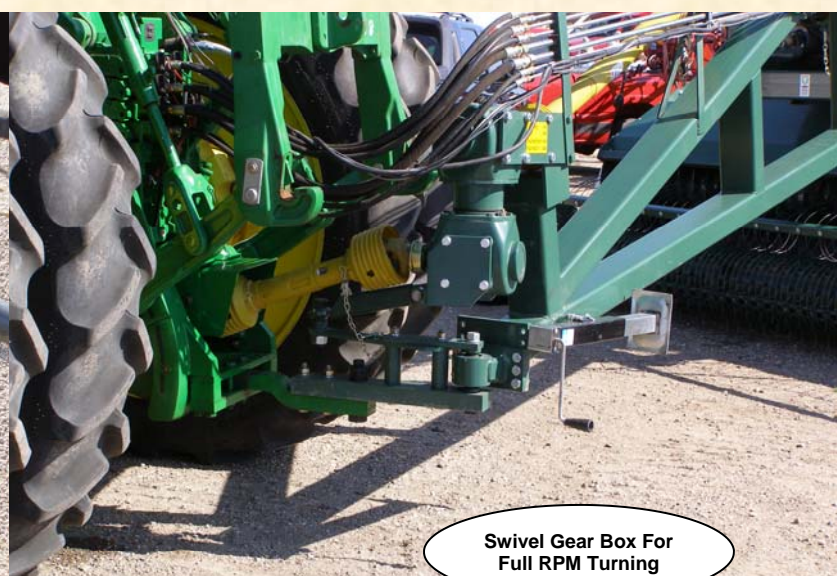
Swivel Gear Box For Full RPM Turning