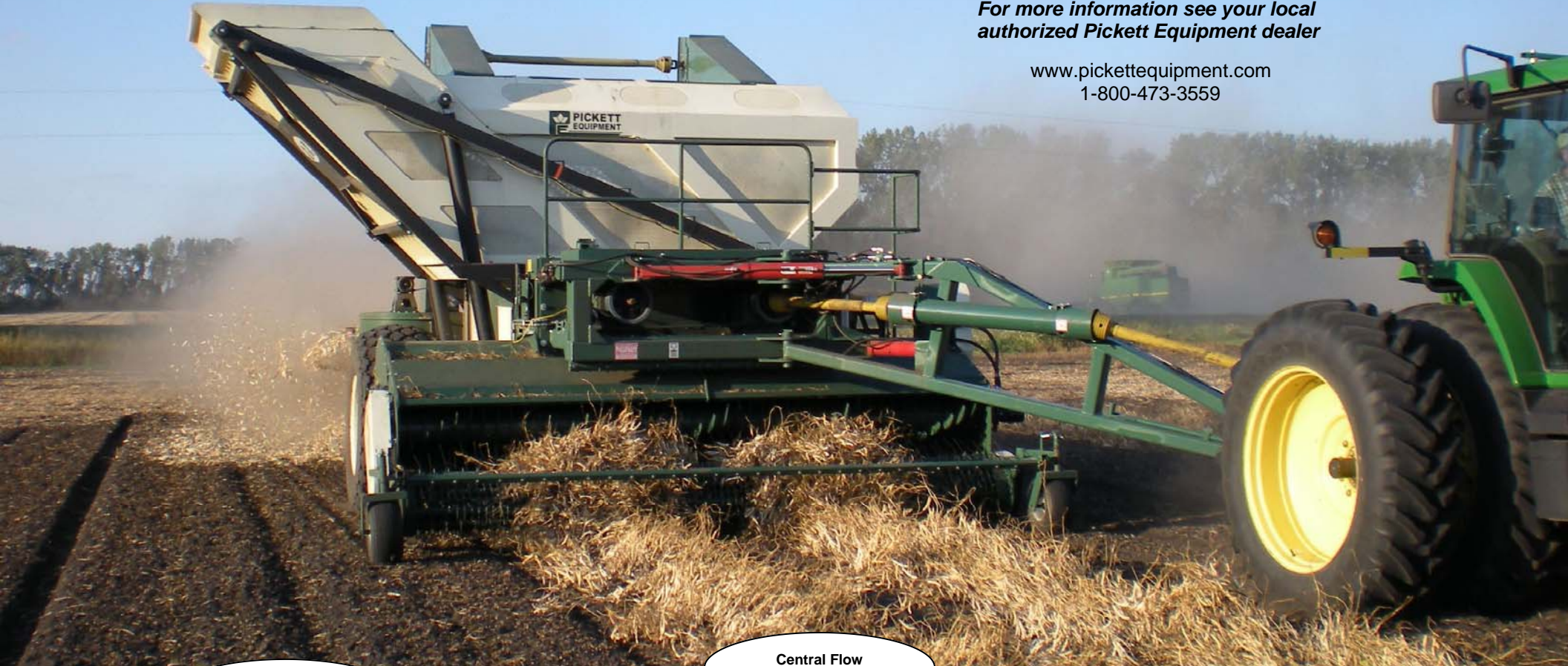
Tongue Tilted For Transport